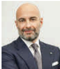
DANTE BRANDI Consul General Consulate General of Italy HCMC